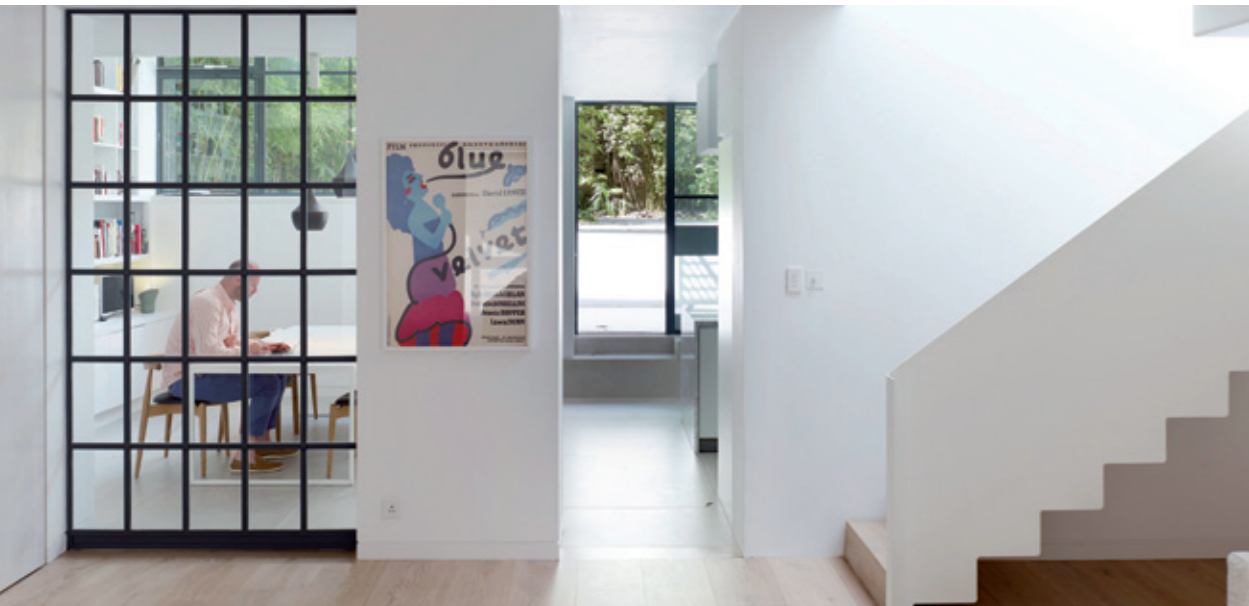
Stiff & Trevillion